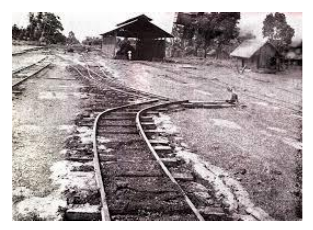
Fig. 2: Railway tracks deformed in the Saikhoaghat Railway station