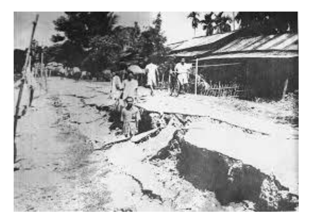
Fig. 4: Cracks observed in the road, near Dibrugarh Town