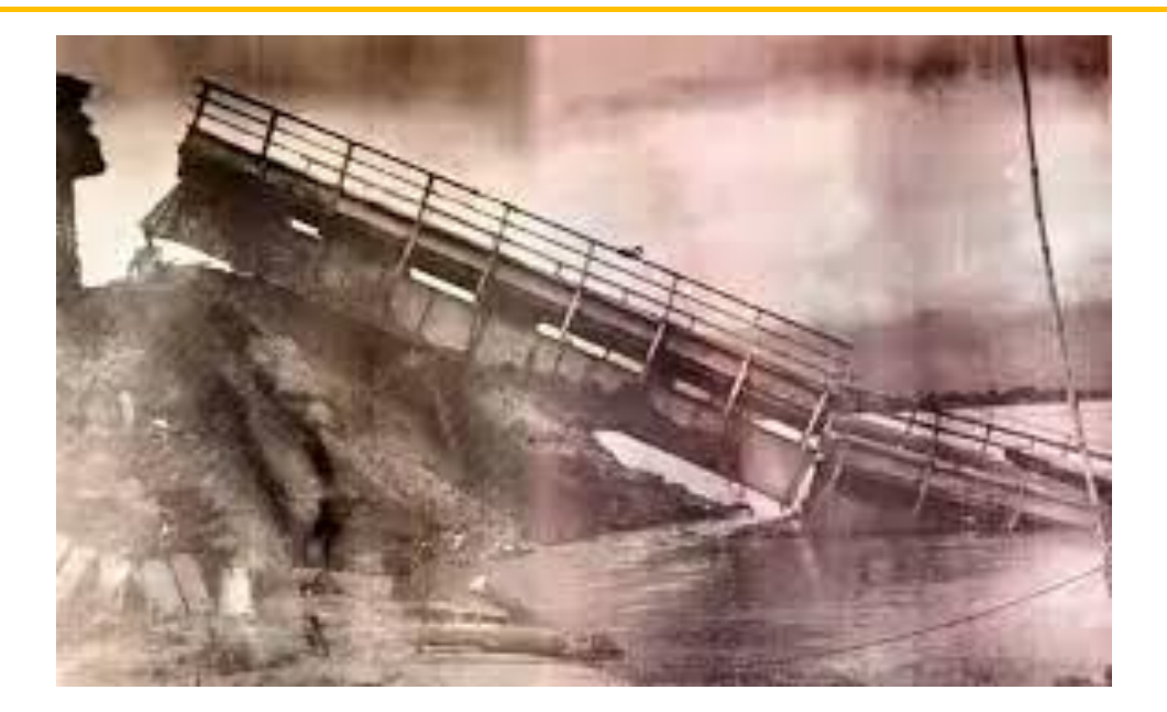
Fig. 3: Damaged road bridge over a river in Upper Assam