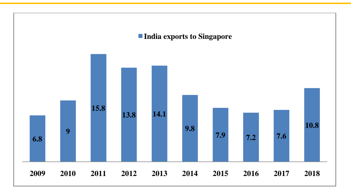
Figure 3: India's Export to Singapore

to US$ 21 million in 2009-10. On the other hand, India's imports immensely improved during 2015-16 amounting to US$ 48 million.